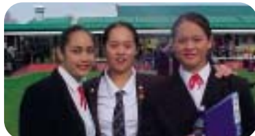
A view of the students during lunch break Hinemihi, Raukura and Parehuia Huata