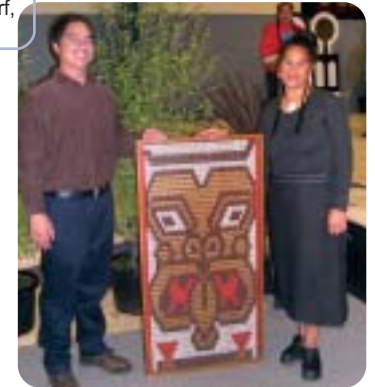
Local group Te Rauhina reformed early this year after disbanding in 1996, won a number of awards and finished third overall.