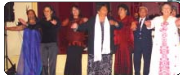
Wahine join in as part of the entertainment with Kahungunu Kaphaka and Waiata.