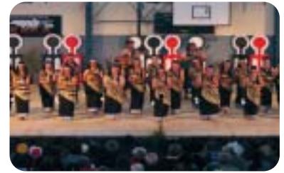
Wairoa local group Te Ataarangi on stage during the kapahaka festival.

Wairoa was packed on the 20th June when crowds from all over Kahungunu came to join in the Ngāti Kahungunu Kapahaka Competition. Six teams of 40 participants entered the competition. The teams were Te Tawharangi from Hastings, Te Hononga Mareikura from Hastings and Omaha, Tamatea Arikiniui from Porangahau and three Wairoa teams: Te Ataarangi, Te Rauhina and Rerenga Kotuku. No teams from Wairarapa entered this year.