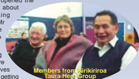
Members from Kirikiriroa Taura Here Group