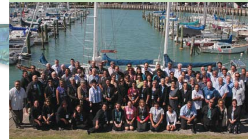
Picture taken at the Napier Sailing Club during the inaugural Fish Hook Summit.

On 10th March this year the inaugural Fish Hook Summit was held. This event was an opportunity for Hapū o Ngāti Kahungunu to connect and communicate, celebrate what's been achieved, and explore opportunities and share ideas for going forward. It was a positive event and we received enthusiastic reviews. Plans are underway to make it a regular part of our events calendar with the next Summit planned for 9th and 10th March next year.