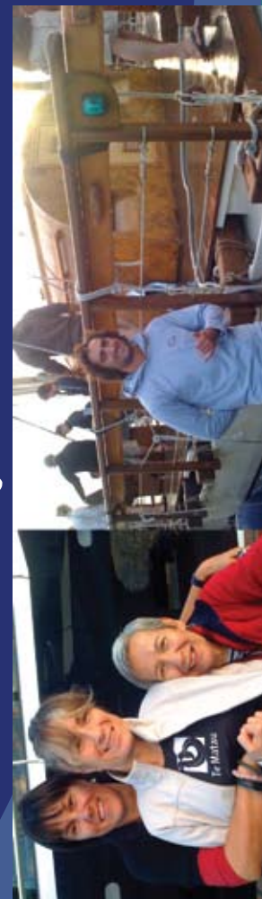
Pictures taken at the farewell of Te Waka Hourua when the waka set sail across the Pacific Ocean 2011