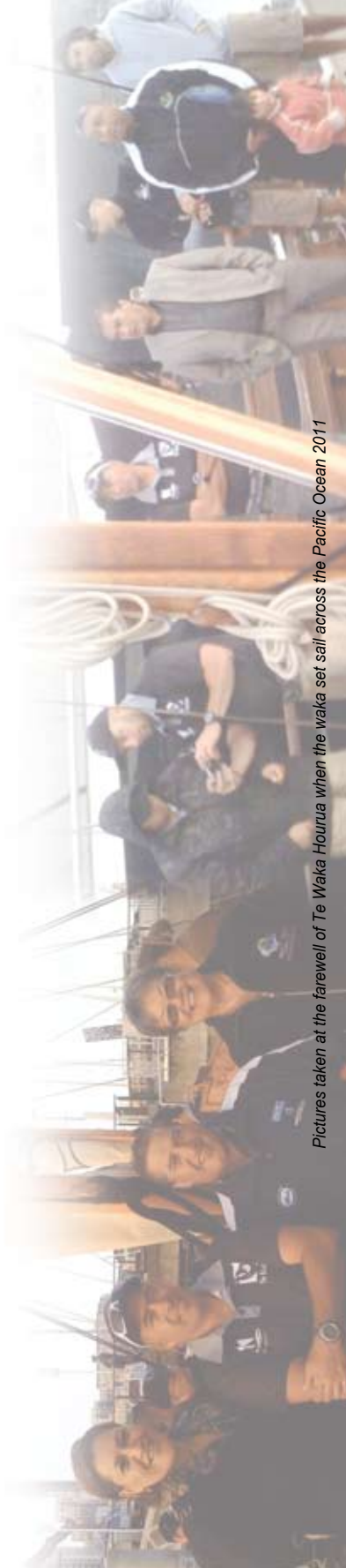
Pictures taken at the farewell of Te Waka Hourua when the waka set sail across the Pacific Ocean 2011

LOWE HOUSE 304 FITZROY AVENUE, PO BOX 2406, HASTINGS 4153, NEW ZEALAND PHONE 06 876 2718 • FAX 06 876 4807 • TOLL FREE 0800 KAHUNGUNU (0800 524 864) EMAIL: paatata@kahungunu.iwi.nz WEB: www.kahungunu.iwi.nz