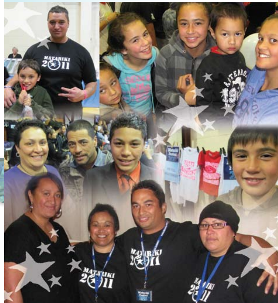
Various pictures taken at the Tamaki Nui A Rua Matariki event held on the 10th June 2011.

The Matariki events in other areas of Kahungunu have continued to be of great success as local leaders have taken on more responsibility for the planning of these events. More pictures and information will be available on facebook.com/kahungunu.