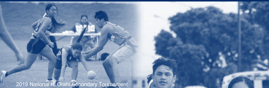
2019 National Ki Orahī Secondary Tournament