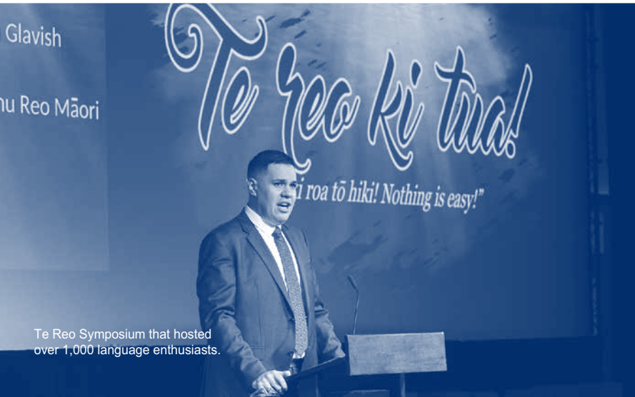
Te Reo Symposium that hosted over 1,000 language enthusiasts.

Pouarataki – Director, Te Reo, Tikanga me Mātauranga