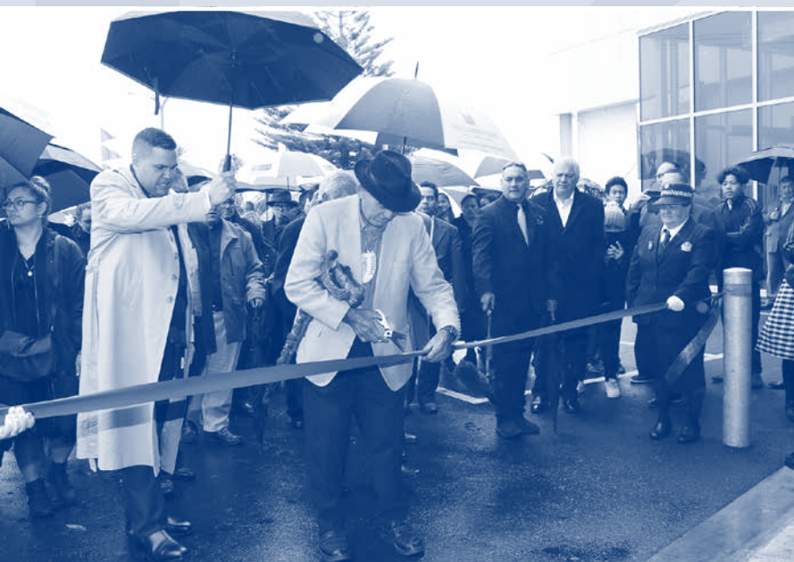
Opening of Takitimu Seafoods - 8 April 2019