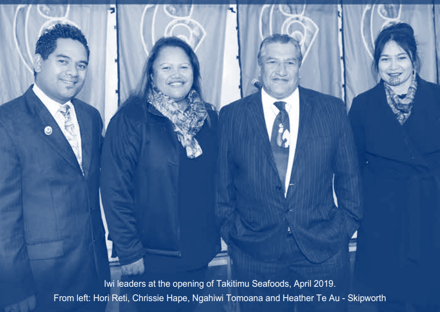
Iwi leaders at the opening of Takitimu Seafoods, April 2019.