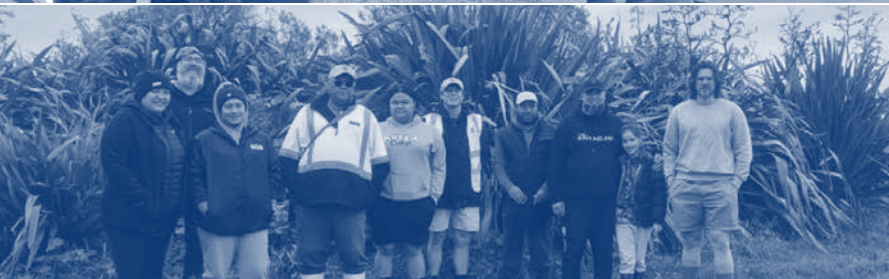
Pictures taken by our Taiao team reflecting some of the mahi done over the year.