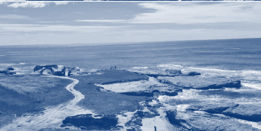
Pictures taken by our Taiao team reflecting some of the mahi done over the year