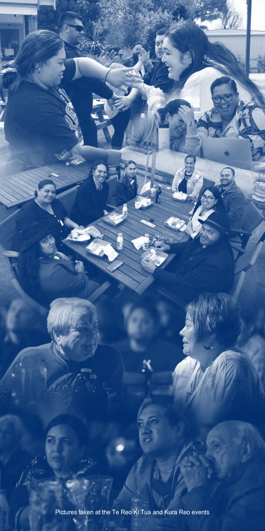
Pictures taken at the Te Reo Ki Tua and Kura Reo events