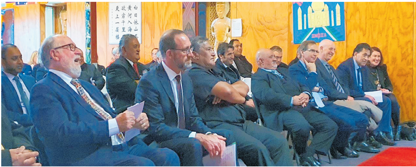
Rangatahi Te Kooti Te Aranga Marae.