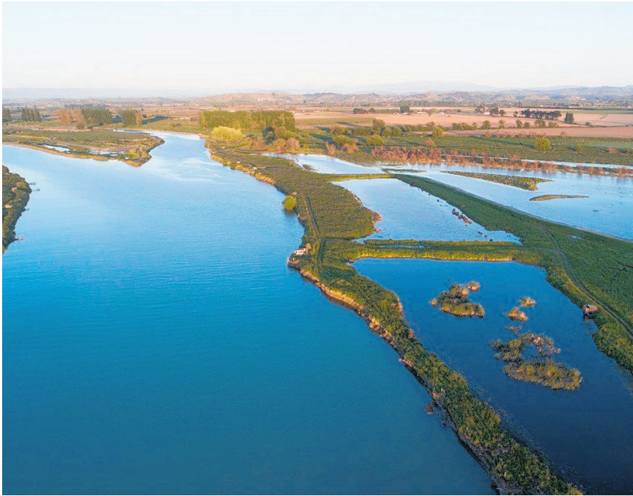
Waitangi Estuary (Mouth of the Tūtaekuri river).

"I'm really happy because of what this job represents, it lines up with my morals and I wanted to get back to my culture and understand how to really look after the land."