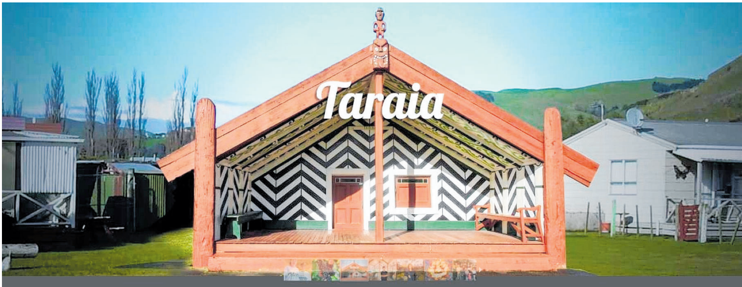
Taraia Marae is one of the oldest whare houses of the Heretaunga District and has an illustrious history spanning 200 years. Taraia is significant for its age and was originally built in the traditional style without European tools, eventually gaining a European door and window.