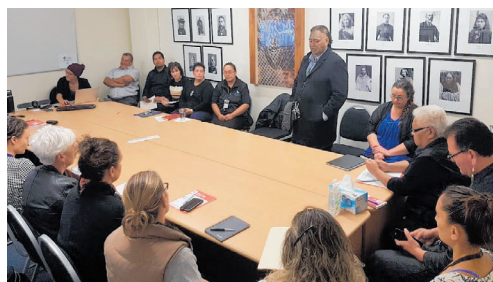
The planning hui held in 2020.

the Tihei Mauri Ora kaupapa. We are grateful for those involved and their families who sacrifice their time as they work in our communities.