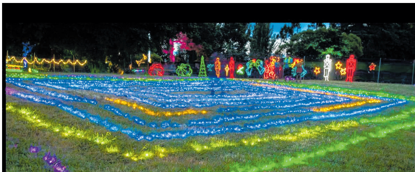
The Fiesta of Lights in Hastings opens on December 18.