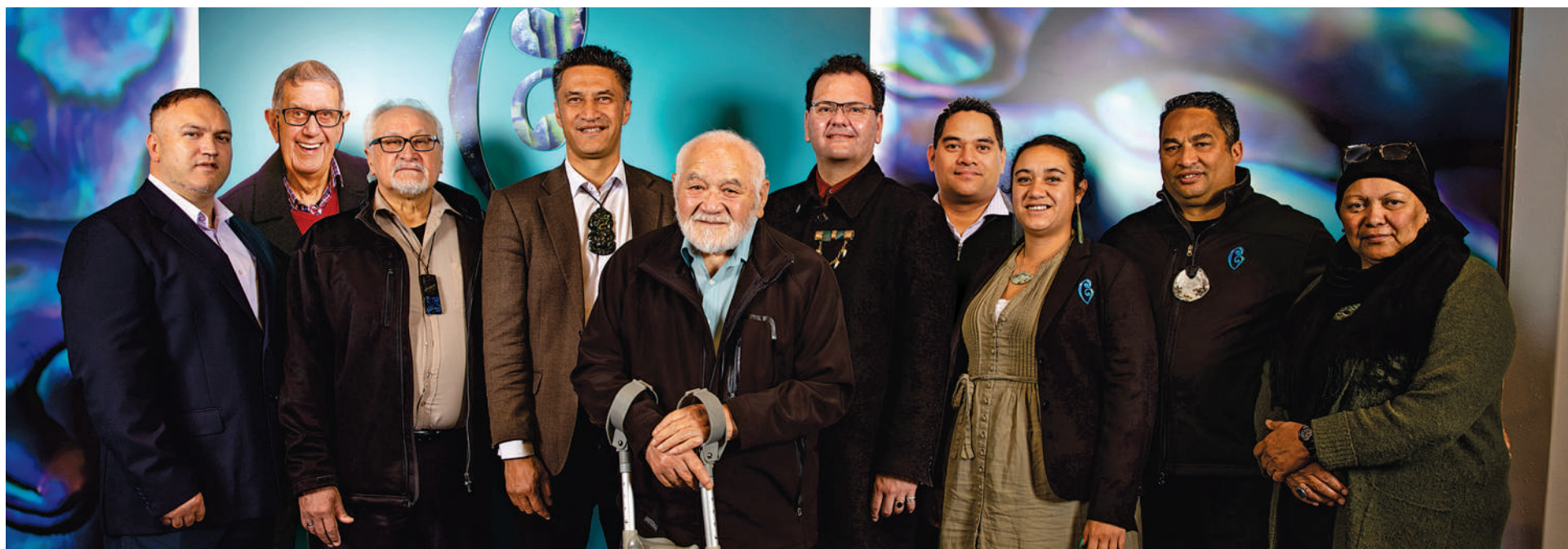
The current board of Ngāti Kahungunu Iwi Incorporated.