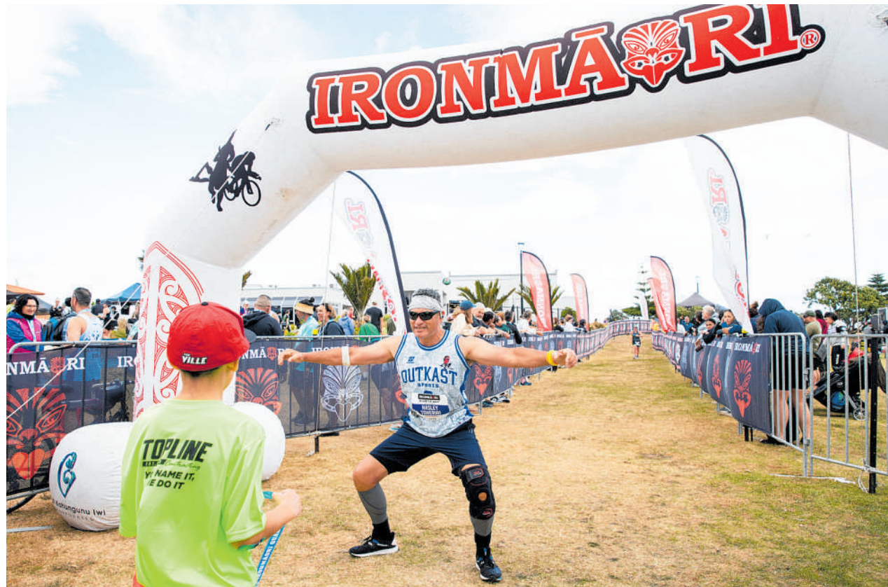
Ngāti Kahungunu's inaugural IronMāori Marae Wero will take place in May.

Open to ages 14 and over, people can choose to finish the whole triathlon alone or pull