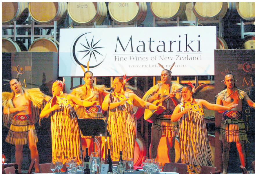
Way back in 2007, a Māori dance group perform during the Matariki Winery Annual Dinner in Hastings.