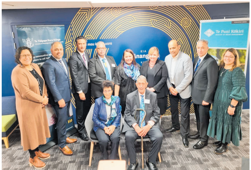
Kahungunu forging forward to build dry warm homes for our people.